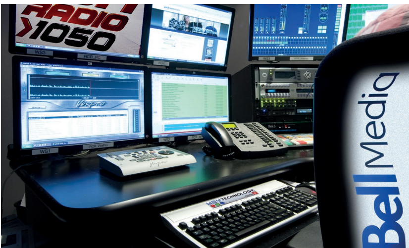
WEYTEC's multifunctional keyboard in the studio "TSN Radio 1050" from BellMedia

BELL MEDIA, www.bellmedia.ca , is Canada's premier multi-media company with leading assets in television, radio and digital entertainment and information. It owns 28 conventional TV stations, including CTV, Canada's #1 television network, and owns and operates 30 specialty TV channels, including TSN, Canada's #1 specialty channel, and RDS, Canada's #1 French-language specialty channel. Bell Media also owns 33 radio stations, dozens of websites including the Sympatico.ca portal, and Dome Productions Inc. Bell Media is owned by BCE Inc. (TSX, NYSE stock ticker symbol: BCE), Canada's largest communications company.