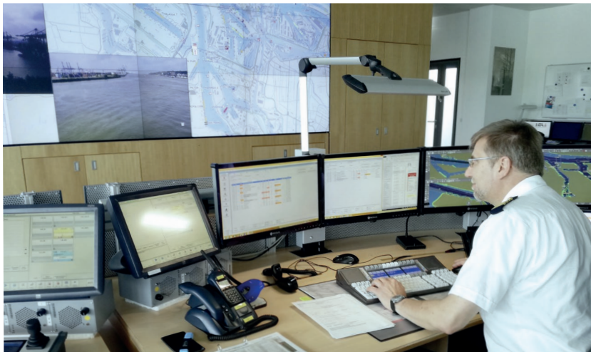
workplace with multifunctional MK06 keyboard

Hamburg is committed to being an intelligent, digitally networked and seamlessly functioning transportation hub and its program is called smartPORT. The aim is to use comprehensive control systems to ensure that shipping, road and rail traffic all remain fluid. The Port of Hamburg thus continues to be a competitive leader and able to cope with growing logistics challenges. The HPA is currently the hub for around 140 million tons of freight per year.