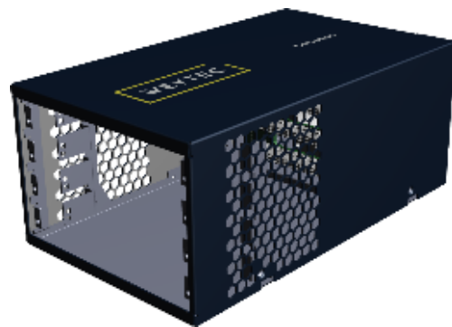
WEYTEC 4 Slot Box

WEYTEC manufactures a selection of chassis to meet customers' full requirements for robust, flexible, space-saving housing units in the system room and at the desk. WEYTEC chassis hold from one to 16 hot-pluggable, Euro-size modules with 20 mm front panels.